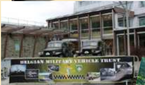
One Day Rally