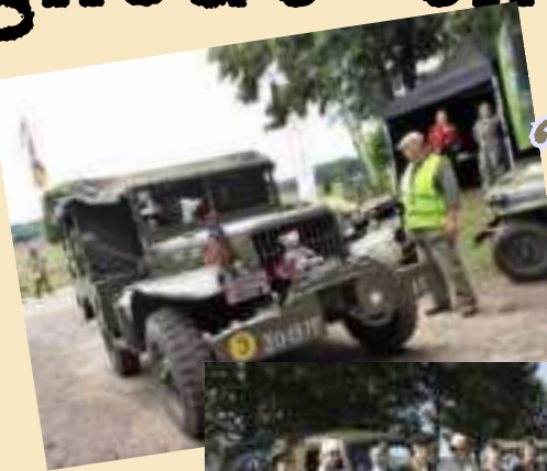
Summer Rally "Women at War"